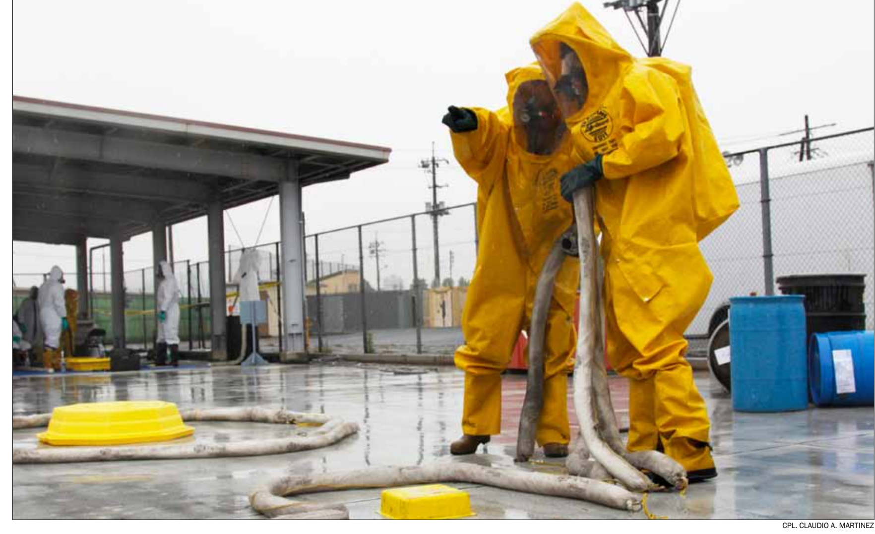
nel discuss how to approach a chemically contaminated site after cording off affected areas during an Introduction to Hazardous Response Course training scenario taught by HazTrain at the tarmac here May 26. The participating personnel used damming and diverting tubes during the training scenarios to cord off simulated chemical runoff.

This is the first time HazTrain has been brought here to teach this course. HazTrain has provided training in environmental health and safety since 1983