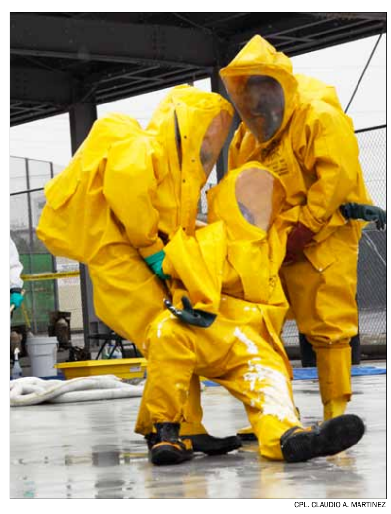
Two station personnel drag their injured team member to a decontamination site during an Introduction to Hazardous Response Course training scenario taught by HazTrain at the tarmac here May 26. The course participant being dragged faked being inju red during the training scenario to test his teammates' ability to react to the situation