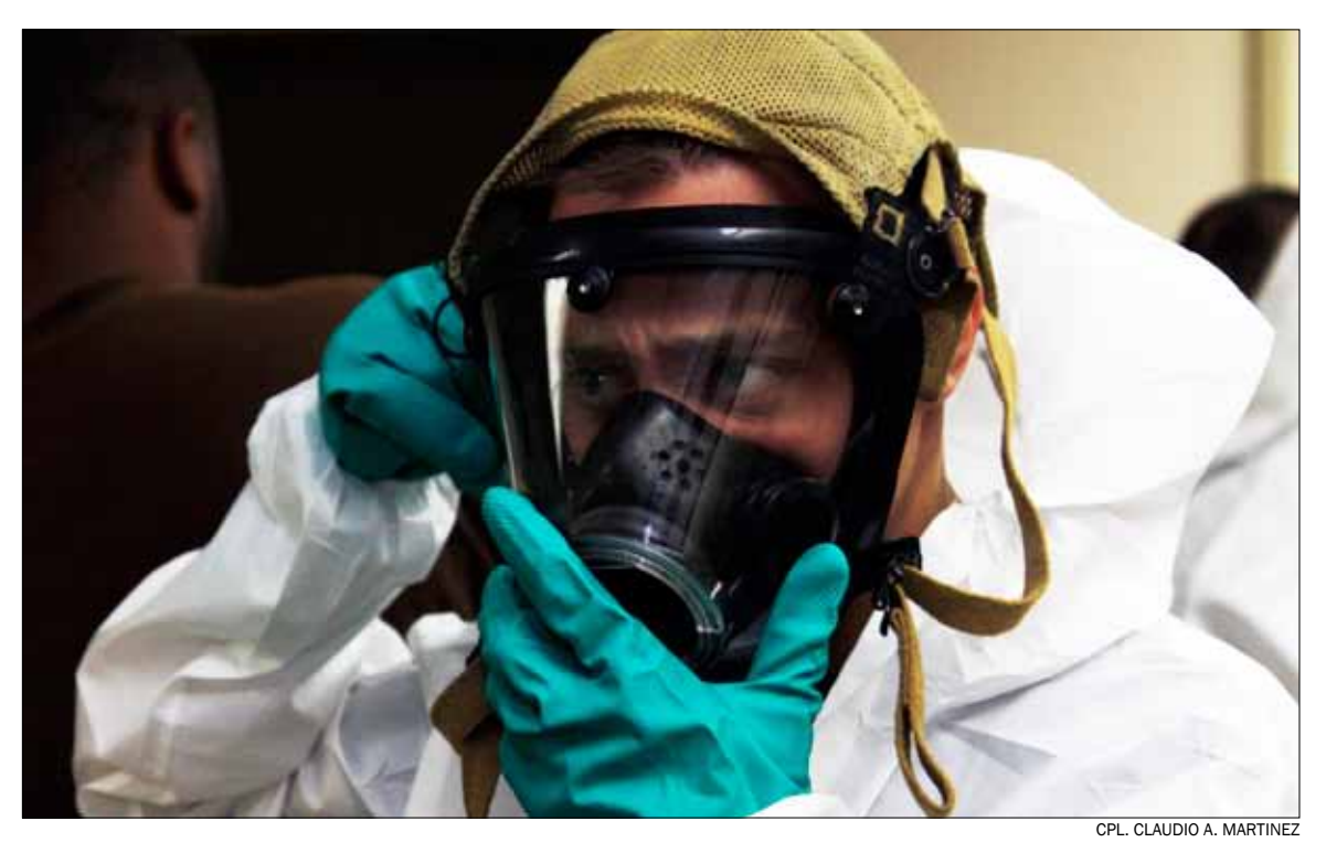
s waste disposer, dons his gas mask during an Introduction to Hazardous Response Course taught by HazTrain at the Learning Center here May 25. The course was taught from May 16-27. The course trained the participating p the basics involved in responding to a local chemical disaste